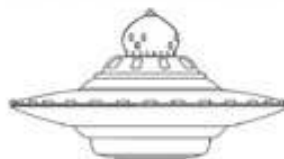
Beamship Type 3