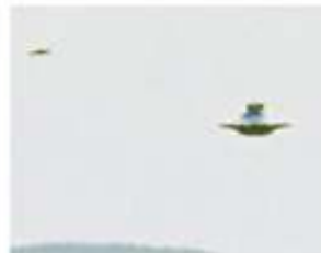
Photo #212 See p. 106 for example