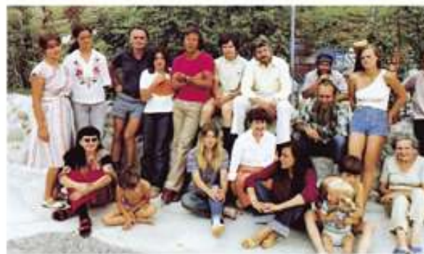
Group photo of witnesses who were interviewed by Wendelle C. Stevens in 1982

Finally, the decades-long disinformation campaign related to UFOs came to a close in Switzerland, although this did not occur until 1994. At that time, one was prepared to release Air Force documents (Division of Swiss Air Force and Air Defense) pertaining to UFO phenomena. With respect to that, it was stressed