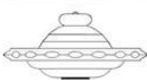
Beamship Type 4