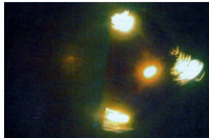
Figure 3: Triangular Aircraft photographed over Belgium skies.